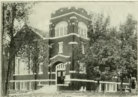
HUMBOLDT, KANSAS (Church)